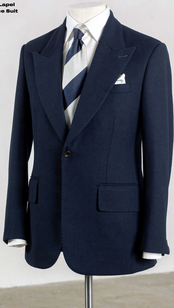
Navy Twill Peak Lapel 2-Piece Suit