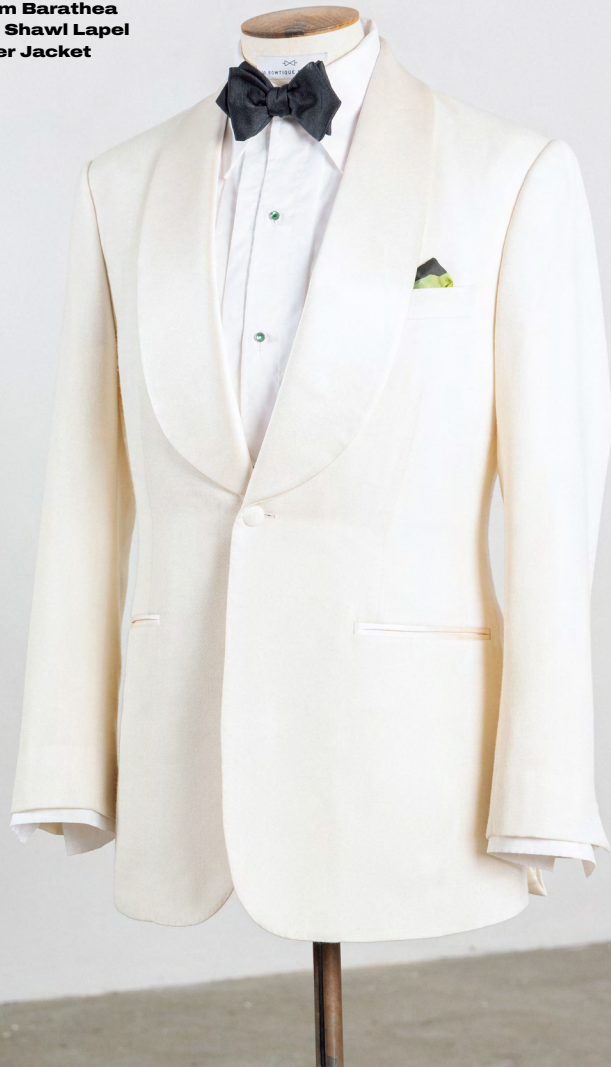
Cream Barathea Wide Shawl Lapel Dinner Jacket