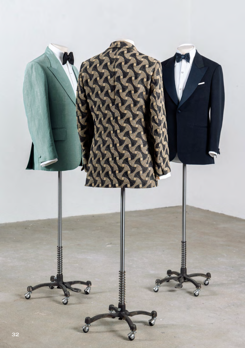
Pale Blue Linen Windowpane Peak Lapel Jacket