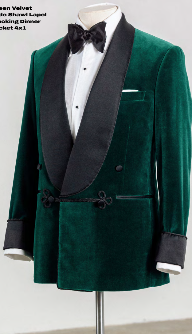
Green Velvet Wide Shawl Lapel Smoking Dinner Jacket 4x1